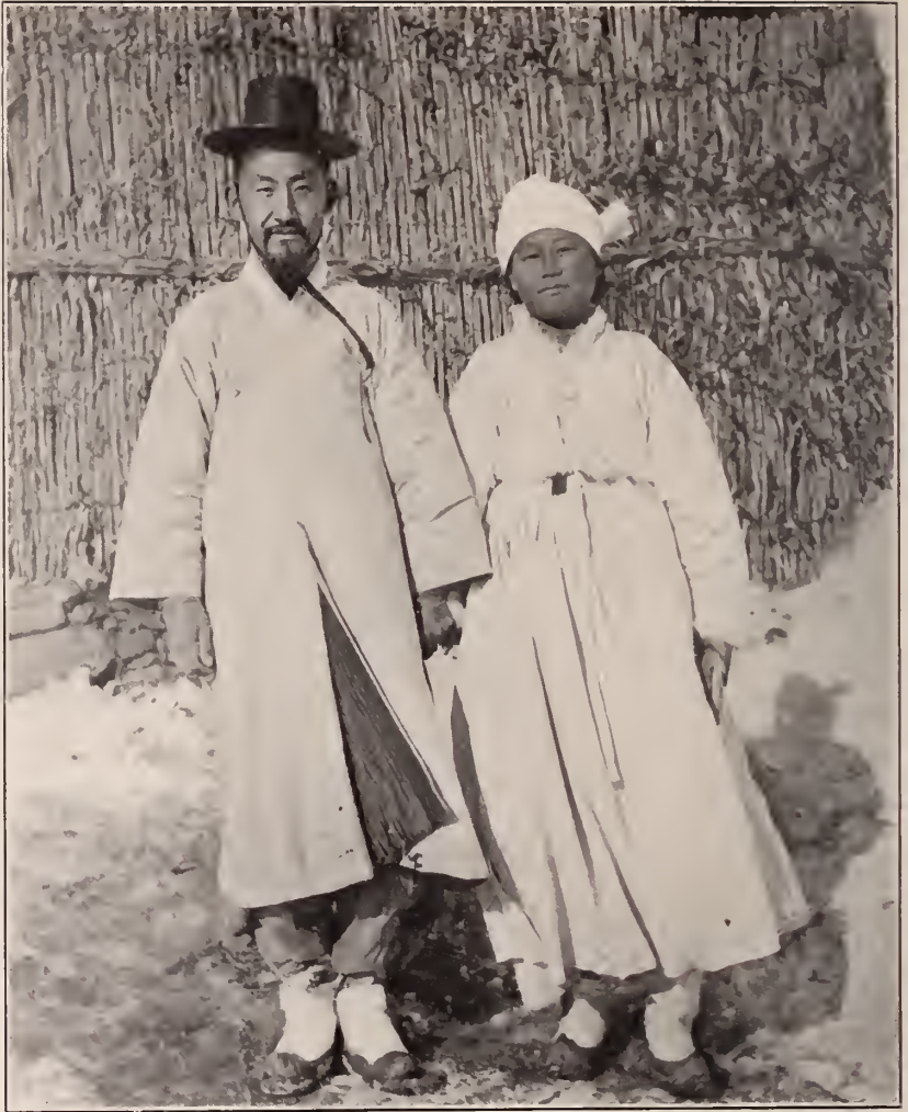
A KOREAN METHODIST PASTOR AND HIS WIFE