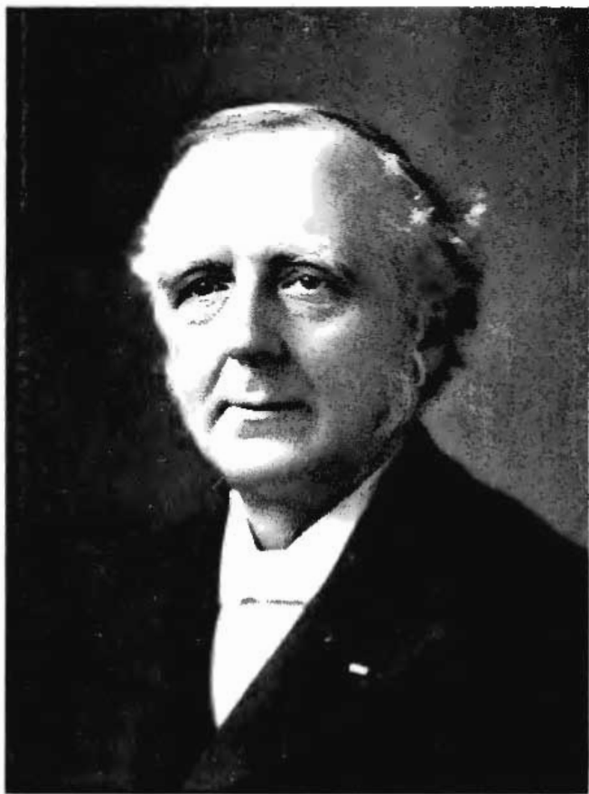
REV. F. B. MEYER.