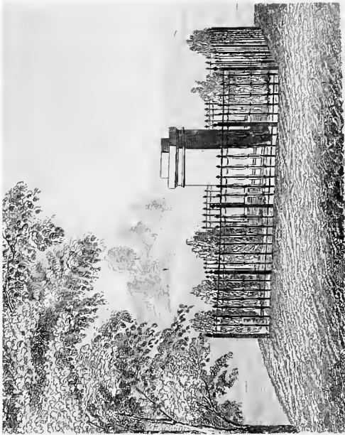
MONUMENT TO MARY LYON