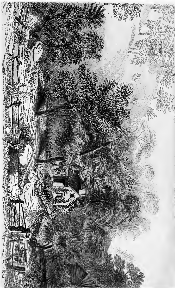
SEVENTH PL. OF MARY LYON